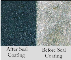
After Seal Coating

Call for a Free Estimate! 10% Springs Resident Discount